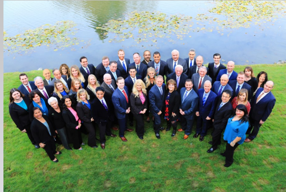
The DWA Team-2018

Securities and investment advisory services are offered solely through Ameritas Investment Corp. (AIC). Member FINRA/SIPC. AIC and David White & Associates are not affiliated. Additional products and services may be available through David White & Associates that are not offered through AIC. Representatives of AIC do not provide tax or legal advice. Please consult your tax advisor or attorney regarding your situation.